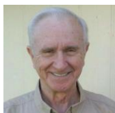
Member-At-Large: Sterling Arms